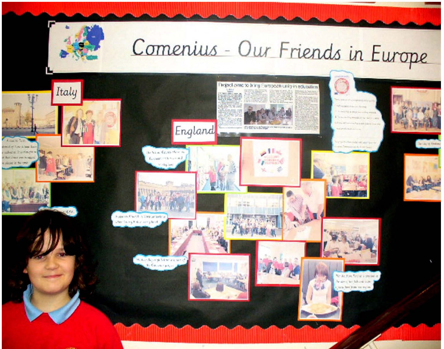
The Great Britain team 1:

"We can all share ideas so that we can make improvements to our school so that everyone is satisfied."